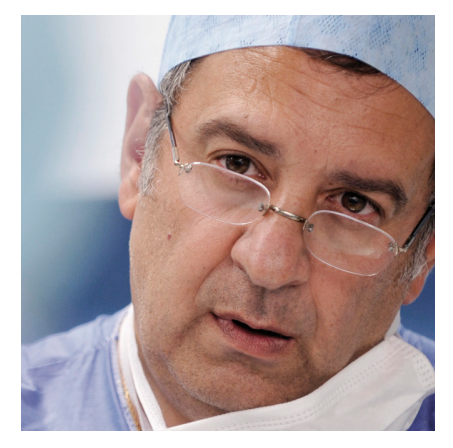
'Using Mölnlycke procedure trays took us into a new era in implant surgery.'

More time to take up training and coach trainees 1