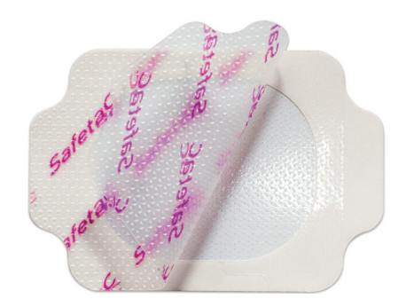
With Mepitel Film